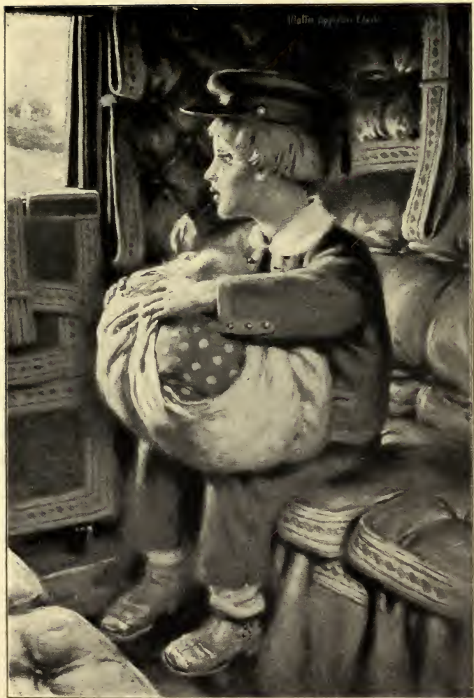
"PEERING OUT . . . WITH SERIOUS, BLUE EYES"